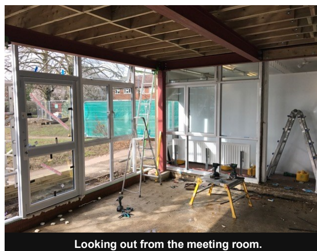
Looking out from the meeting room.

This has been quite a noisy phase of the work, so we are looking forward to a quieter period over the coming weeks!