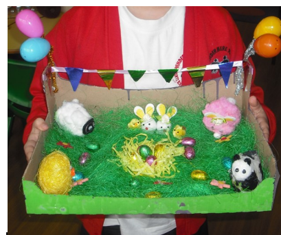
A delightful Easter scene from recent years.

We will be sending out some new, more specific consent forms soon, in the hope that we can use more of our lovely children in photographs.