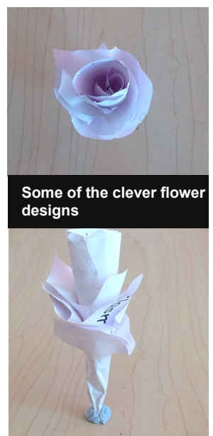
Some of the clever flower designs

The children used scissors and simple folds and twists to create fascinating flowers. We will be choosing the best examples and enter them into a County competition.