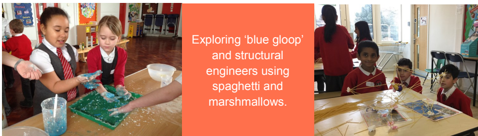
Exploring 'blue gloop' and structural engineers using spaghetti and marshmallows.